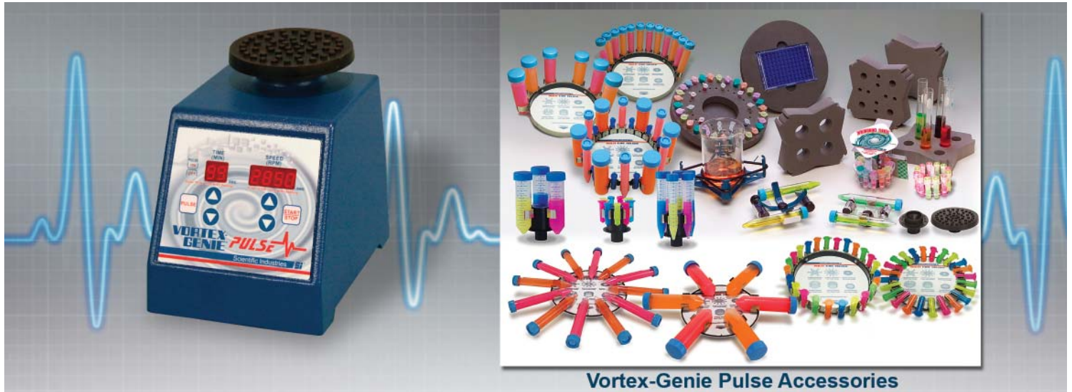
Vortex-Genie Pulse Accessories